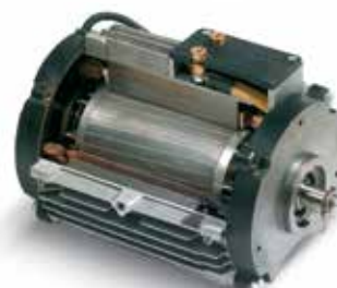
3-phase AC motor, completely enclosed, less parts to wear