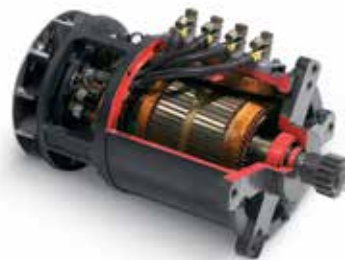
Shunt-wound or series-wound motor with carbon brushes and commutator