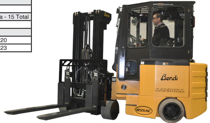
*Optional Cab Shown